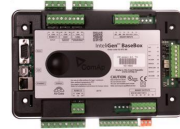
ComAp IntelliGen BaseBox