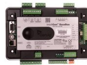
ComAp IntelliGen BaseBox