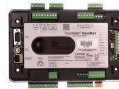
ComAp IntelliGen 200