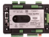
ComAp IntelliGen 200